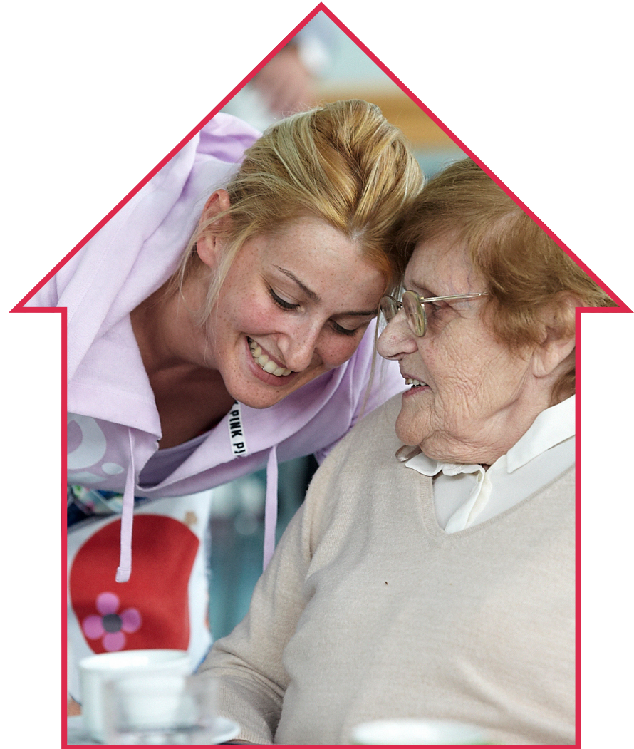
Together We Can Raise the Roof!

If you get involved in our Raise the Roof project you will not only be updated on our Roof Project as we progress but your team will have the opportunity to get first hand experience of how your support has improved the lives of our residents through meeting our residents & seeing the work first hand! See our Sponsorship Sample Package below for more benefits!